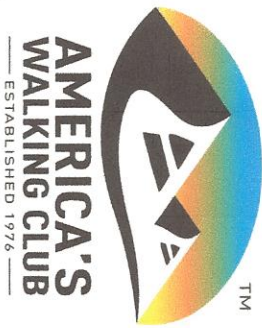
AMERICA'S WALKING CLUB ESTABLISHED 1976