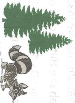
EAST TEXAS TREKKERS