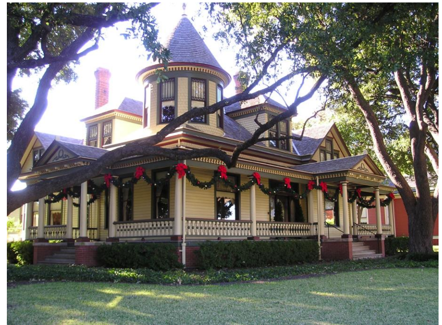
A Wilson District Home