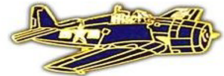
NAVY HELLCAT FIRST FLIGHT 1942